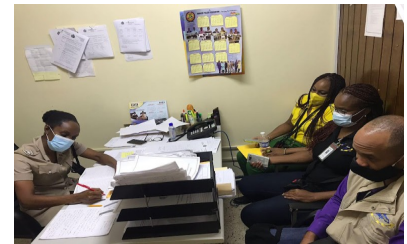
The PCOA Team (right) briefing the Administrative Officer at the Black River Station in St. Elizabeth.

In the meantime, there were concerns pertaining to derelict vehicles and motorcycles cluttering some 20 stations across the three divisions; the continual poor condition of bathroom facilities at 14 stations in Area 3; and unsuitable location of strong pans at three stations.