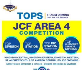
Area 4 TOPS Competition Poster

viously been held in Area 2 (Portland, St. Mary and St. Ann divisions) and Area 5 (St. Catherine North, St. Catherine South, St. Andrew North and St. Thomas divisions).