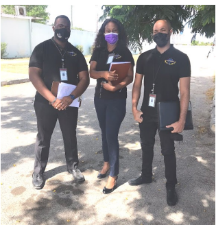
The PCOA Team all ready to inspect the Greater Portmore Station in the St. Catherine South Division.