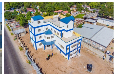
Before and After: The Olympic Gardens Station in 2012 and 2021.