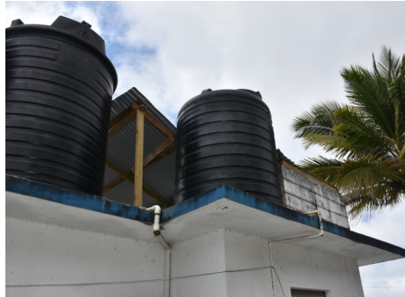
The refurbished water supply system located on the roof of the Bamboo Station. A structure was created from zinc and lumber to harvest rainfall.

fall. “ We are definitely in a better way to serve the community,” he stated. The appearance of the reception area was aesthetically enhanced with the replacement of old tiles.