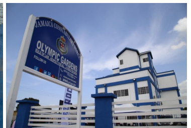
JCF Signage at the Olympic Gardens Station in 2012 and 2021.

creating the ambience for citizens to comfortably and willingly engage with the police.