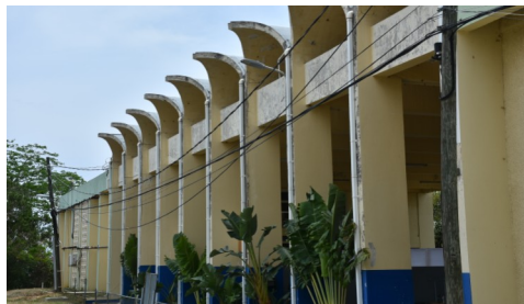
The façade of the National Police College in Twickenham Park, St. Catherine.