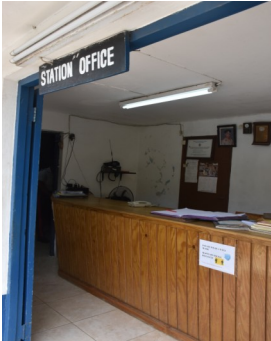
Newly tiled area in the reception area of the Bamboo Station in the St. Ann Division.

As a result of the improvements, the station is able to properly harvest rain-