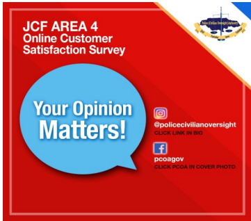
Area 4 Online Customer Satisfaction Survey Poster.

“We decided that there was not only a need to widen the partici-