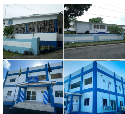
Top Photos: The fagade and side of Buff Bay Station in 2014. Bottom Photos: The fagade and side of the newly constructed two-storey Buff Bay Station in December 2021

The Buff Bay Station is one of several stations that have benefitted under the Rebuild, Overhaul and Construct (ROC) project, which aims to rebuild, renovate and retrofit police stations island wide. Some $14 billion will be invested in police facilities over a three-year period.