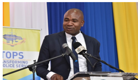
State Minister in the Ministry of National Security, The Hon. Zavia Mayne giving remarks at the awards ceremony for the Transforming Our Police Service (TOPS) Competition for Area 3 held at the Golf View Hotel in Mandeville, Manchester.

“Under that interim procedure, the government is restricted to contributing to a general legal defence fund for Constables. This is instead of being able to directly pay the legal fees for Constables, who may be