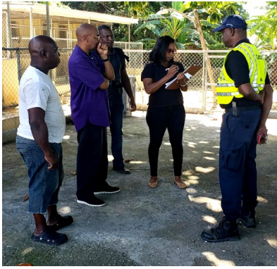
The PCOA Team at Area 1 Headquarters on Church Street in Montego Bay, St. James, where the kennels and dogs are located in the west.

The PCOA Team commenced a thematic inspection of the Jamaica Constabulary Force (JCF) Canine Division in November.