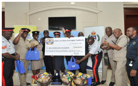
An ecstatic contingent from the Westmoreland Division posing with their prizes for Top Division, Top Customer Service Division and Top Station in the Transforming Our Police Service (TOPS) Competition for Area 1.