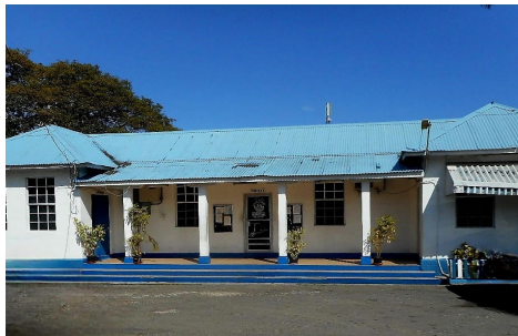
The ISO-9001 certified Matilda’s Corner Station in the St. Andrew Central Division. This station was one of the first to attain this designation.